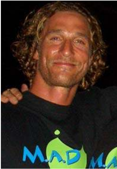
Matthew McConaughey proudly wearing his Managing Australian Destinations (MAD) T Shirt

During November, Port Douglas played host to superstars Matthew McConaughey, Donald Sutherland and Kate Hudson (with her entourage including Goldie and Kurt) when they were in town filming their newest flick, " Fools Gold ".