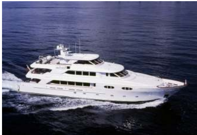
MY Keri Lee starring as Precious Gem in the movie, Fool's Gold.

The stunning co-star of the shoot was the newly arrived charter superyacht, Keri Lee , appearing under her movie stage name, Precious Gem !